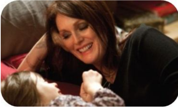
WHAT MAISIE KNEW by SCOTT MCGEHEE and DAVID SIEGEL USA / 2012 / 95' / English

Darkly comic and emotionally compelling, WHAT MAISIE KNEW is an evocative portrayal of the chaos and complexity of a modern marriage.