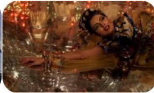
MISS LOVELY by ASHIM AHLUWALIA India / 2012 / 115' / Hindi