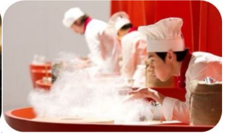
FINAL RECIPE by GINA KIM South Korea / 2013 / 98' / English / Drama

Darkly comic and emotionally compelling, WHAT MAISIE KNEW is an evocative portrayal of the chaos and complexity of a modern marriage.