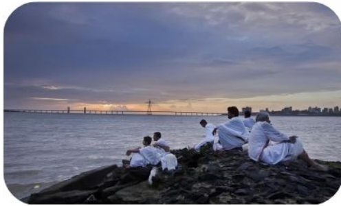
SHIP OF THESEUS by ANAND GANDHI India / 2012 / 139' / Hindi, English